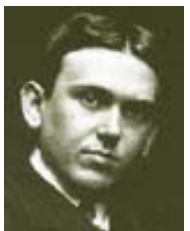
H L Menckhen

"A man is accepted into church for what he believes--and turned out for what he knows."