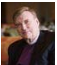
Bishop John S Spong

"We must respect the other fellow's religion, but only in the sense and to the extent that we respect his theory that his wife is beautiful and his children smart."