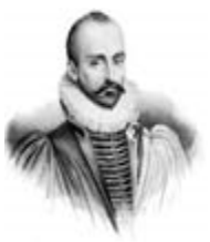
Michel de Montaigne

"The Christian resolution to find the world ugly and bad has made the world ugly and bad."